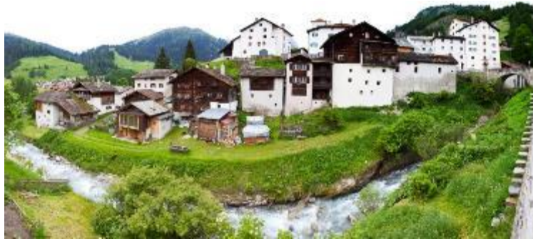
The centre of Splügen with the Hinterrhein passing by

Whereas Meiringen and its surroundings are well known to many Sherlockians, the second location we will visit is entirely new territory for most of us. It is linked to another dark character in the Canon. The Splügen mountain pass, is located in the Canton of Grisons, along the Swiss Italian border, and it is there where that most repellent man in the Canon, Baron Adelbert Gruner, murdered his wife.