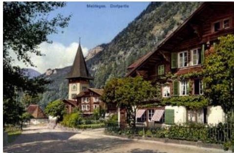
The old part of Meiringen that survived the devastating fire on 25 October 1891

We hope that top notch papers on dark deeds in the Canon will attract seasoned Sherlockians to return to Meiringen and its surroundings and be an incentive for those who have never visited it to join us. A visit to the Reichenbach Falls is on the programme. We will examine the escape of Colonel Sebastian Moran and we plan to conduct an inquest into the death of Moriarty. Finally, we should be some of the first Sherlockians to inspect the state of the planned extension of the permanent exhibition of the Sherlock Holmes museum at the English Church. The Meiringen municipality which runs the museum recently started on an ambitious project that should lead to the doubling of the current space being used for the museum by integrating into it the nave of the former English Church. The museum is currently in the basement.