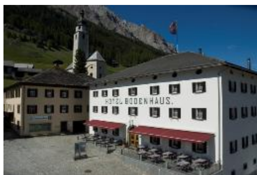
Hotel Bodenhaus, our hotel during our stay in Splügen

We will travel from Hasliberg Reuti across the Alps to Splügen and we will not only present a series of papers on the circumstances of this notorious murder but we will also actually undertake the first ever Sherlockian excursion to the Splügen Pass itself, which has for generations been known as “the evil pass”.