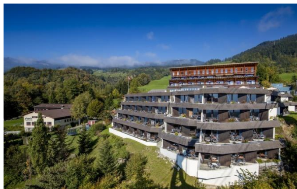
Das Panorama Hotel, Hasliberg-Reuti, just above Meiringen

We hope that top notch papers on dark deeds in the Canon will attract seasoned Sherlockians to return to Meiringen and its surroundings and be an incentive for those who have never visited it to join us. A visit to the Reichenbach Falls is on the programme. We will examine the escape of Colonel Sebastian Moran and we plan to conduct an inquest into the death of Moriarty. Finally, we should be some of the first Sherlockians to inspect the state of the planned extension of the permanent exhibition of the Sherlock Holmes museum at the English Church. The Meiringen municipality which runs the museum recently started on an ambitious project that should lead to the doubling of the current space being used for the museum by integrating into it the nave of the former English Church. The museum is currently in the basement.